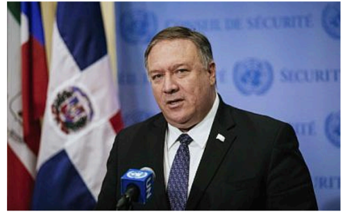
US Secretary of State Mike Pompeo speaks to the press after attending the U.N. Security Council at United Nations Headquarters, Jan. 26, 2019

In a statement, Pompeo said the missile test violated United Nations Security Council Resolution 2231, which was adopted as part of the 2015 nuclear deal curbing Iran's nuclear program and bans Iranian tests of nuclear-capable ballistic weapons.