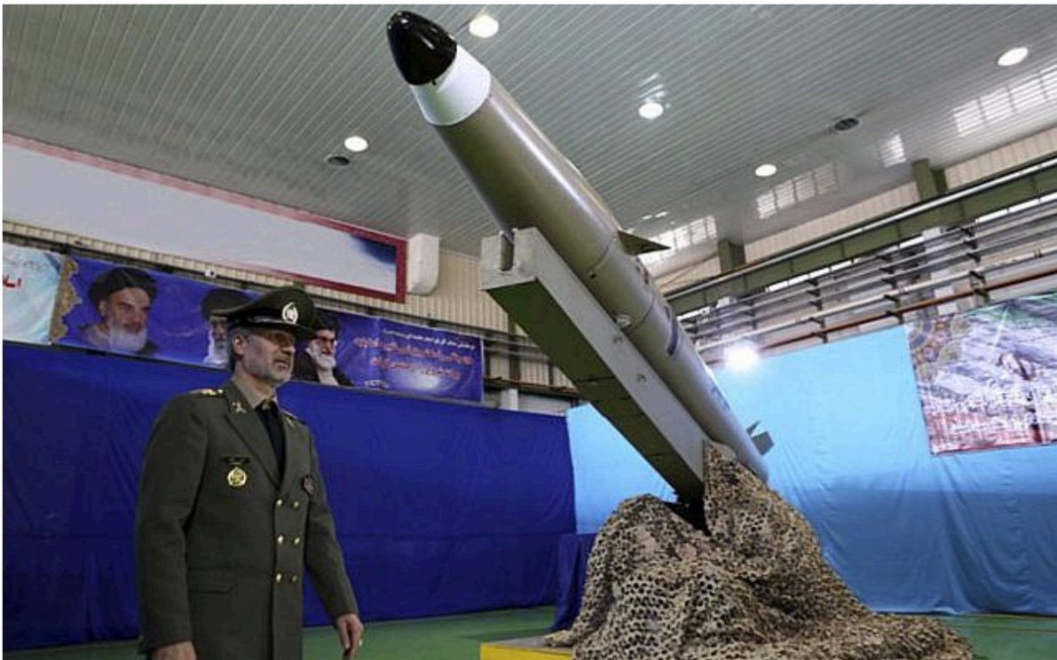
In this picture released by the official website of the Iranian Defense Ministry on Aug. 13, 2018, Defense Minister Gen. Amir Hatami walks past the missile Fateh-e Mobin, or Bright Conqueror, during inauguration of its production line at an undisclosed location, Iran