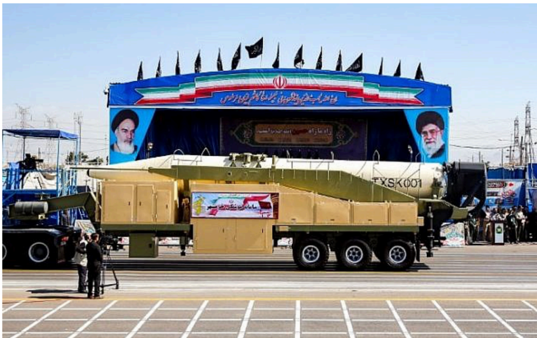
This picture taken on September 22, 2018 shows the long-range Iranian missile "Khoramshahr" being shown during the annual military parade marking the anniversary of the outbreak of the devastating 1980-1988 war with Saddam Hussein's Iraq, in the capital Tehran.

State media: New Khoramshahr 2 is highly accurate, can carry two-ton payloads up to 2,000 kilometers (1,250 miles)